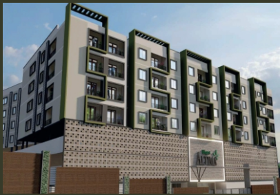
Elegant Altima No of Units : 231 Location : Uttarahalli Handover Date : 2023