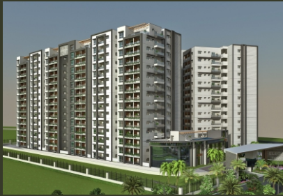
Elegant Ever Green Homes No of Units : 321 Location : Yelahanka New Town Handover Date : Up Coming