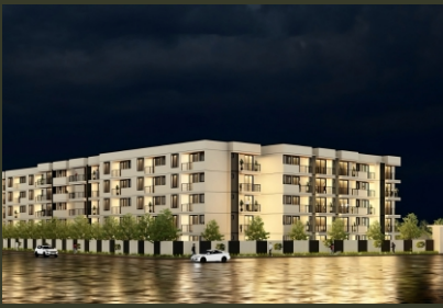
Elegant Sunshine No of Units : 86 Location : Jakkuru Handover Date : Up Coming