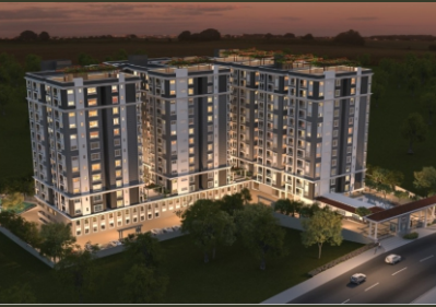
Elegant Hermitage No of Units : 240 Location : Banashankari 6th Stage Handover Date : Under Construction