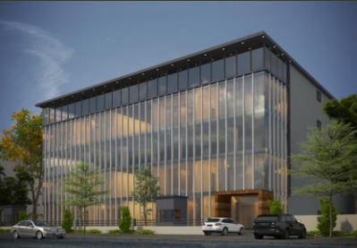
Elegant Edifi Location : WhiteField Handover Date : 2024