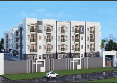
Elegant Exquisite No of Units : 60 Location : RR Nagar Handover Date : 2023