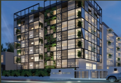
Elegant Exotica No of Units : 87 Location : Yelahanka New Town Handover Date : 2021