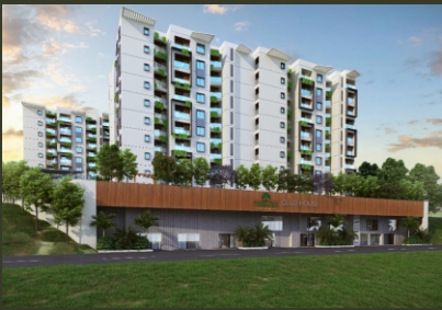
Elegant Terraces No of Units : 120 Location : Banashankari 3rd Stage Handover Date : 2024