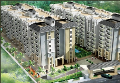
Elegant Whispering winds No of Units : 192 Location : Silk Institute Metro Kanakapura Road Handover Date : 2022