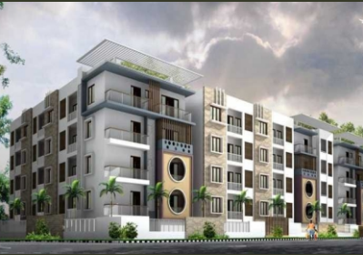
Elegant Esplande No of Units : 100 Location : RR Nagar Handover Date : 2018